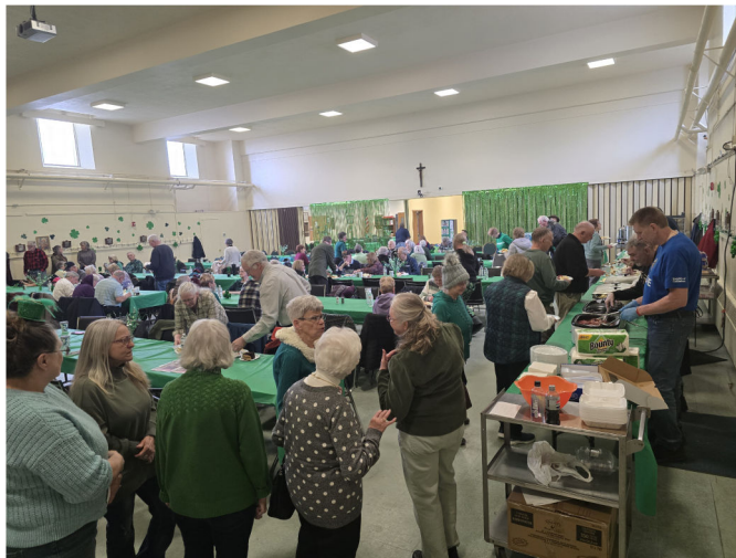
1. St. Patrick's Day Dinner - March 14, 2026